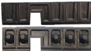
Rubber outlet port options