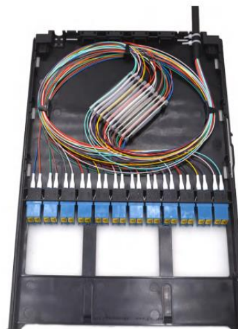
24 Splice connection