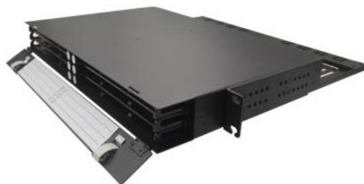
1U/144F LC/72F SC 1U/288F MDC (2ports adapter) 1U/432F MDC (3 ports adapter)