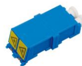
LC duplex inner shutter adapter