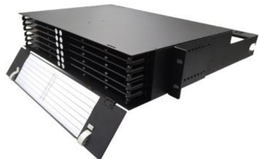
2U/288F LC/144F SC 2U/576F MDC (2ports adapter) 2U/864F MDC (3 ports adapter)