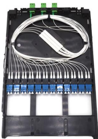
3*1X8 PLC Connection